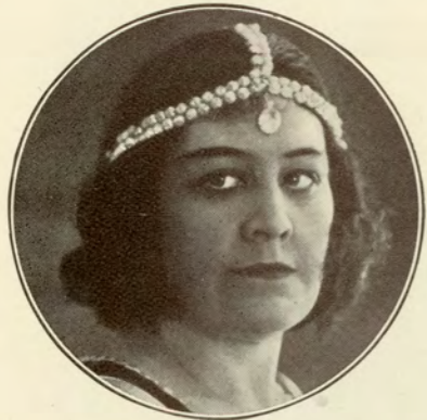
THE GIPSY QUEEN